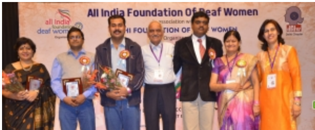
Panel of Jury Members