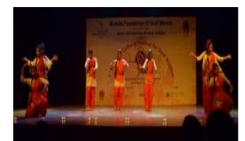
Dance and Drama Cultural artists from 8 states Foundations