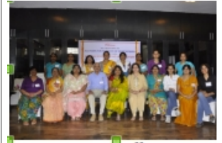
Newly elected Office Bearers and E C Members

Final Result of Newly Elected Body is as follow: