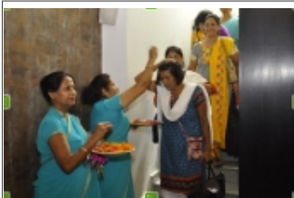
DFDW Hostesses welcomed the Delegates

Assam, Delhi, Hyderabad, Karnataka, Maharashtra, Madhya Pradesh, Orissa, Haryana, and West Bengal