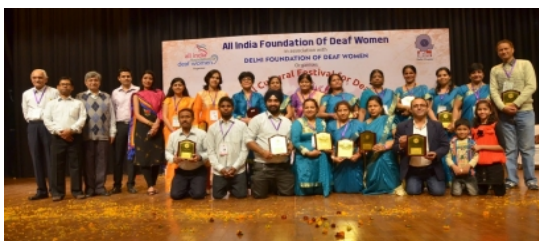
Group photo of DFDW Volunteers

The DFDW is proud to make elaborate arrangement for organizing the cultural event as well excellent food and hostel facilities as well transport for comfortable transport for the participants.