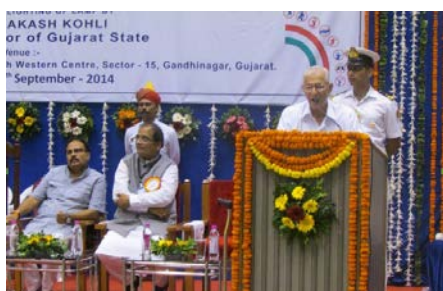
Shri. Om Prakash Kohli, Hon'ble Governor of Gujarat inaugurated the Games