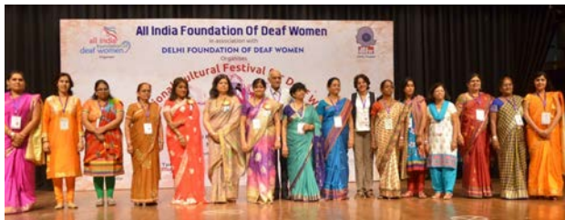
Management Committee of AIFDW