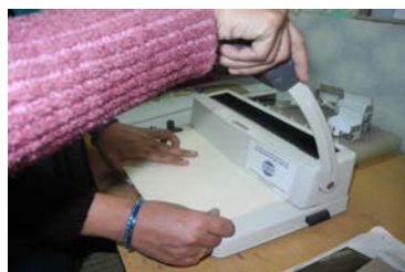
Paper cutting small machine