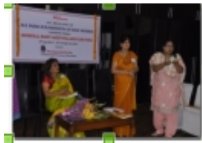
AIFDW's Gen Body Meeting