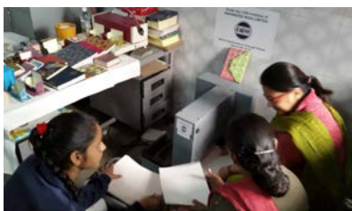
Spiral Binding Machine