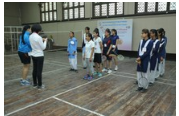
Schools participating in badminton

Complimentary Lunch, Refreshment, Certificates of Merit and Participation and Prizes were provided to all participants and officials.