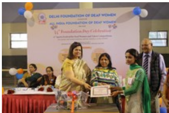
We donated sewing machine to our students completing tailoring course.

Events were conducted to encourage deaf school going children and provide them a platform to show their talents and skill.