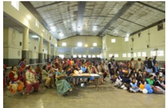
Schools participating in Events